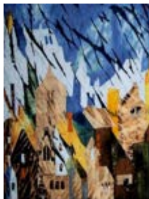
Slice of the City E. Barton