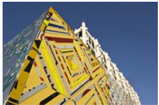
A particular building or icon G Myatt